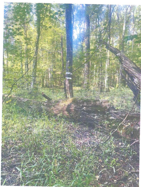
LEFT: Painted property line