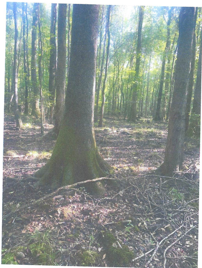
ABOVE: Best tree on property